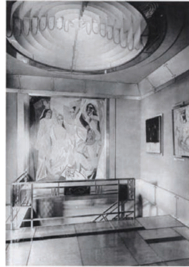
Jacques Doucet's hôtel particulier, 1929