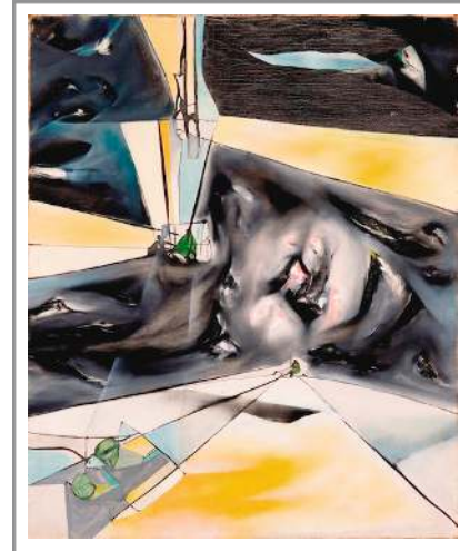
Above: Roberto Matta, The Socket , 1941

we will advise you on every detail to transform it into a transcendent heritage through a Trust or Foundation, where you may even benefit from tax advantages. As each case is treat individually, we invite you to contact us for more details at info@artemundiglobalfund.com .