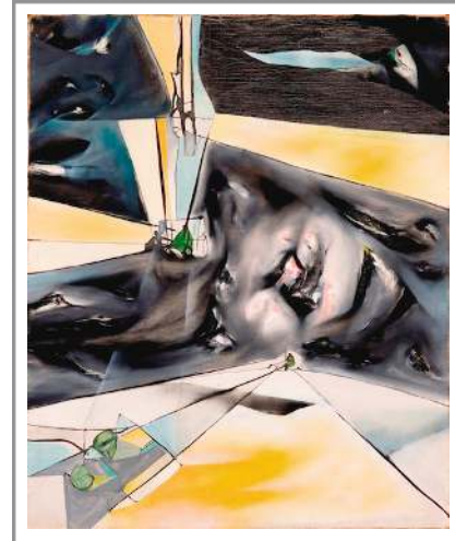
Above: Roberto Matta, The Socket , 1941

we will advise you on every detail to transform it into a transcendent heritage through a Trust or Foundation, where you may even benefit from tax advantages. As each case is treat individually, we invite you to contact us for more details at info@artemundiglobalfund.com .